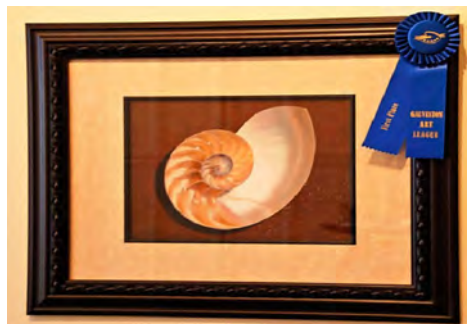
Lauran Perry English, 1 st Place Digital, Nautilus: Thresholds