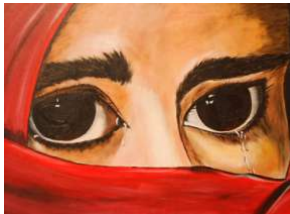
Afghan Eyes Cannot Lie by Bonnie Blue