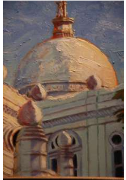
Sacred Heart in October